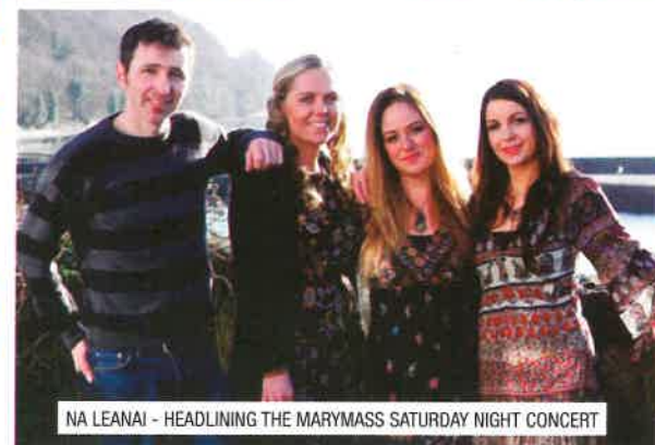
NA LEANAI - HEADLINING THE MARYMASS SATURDAY NIGHT CONCERT